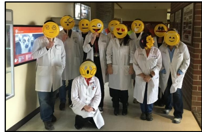
The emotive team of the UWVC Clinical Pathology Laboratory

The UWVC Clinical Pathology Laboratory performs analysis in hematology (Advia 2120), chemistry (Vitros 4600), coagulation (STA Compact and Haemonetics TEG), blood gas and point-of-care (Radiometer and AlphaTRAK), endocrinology and drug testing (Immulite 2000), cytology (including evaluating and reporting immunocytochemical staining for immunophenotyping of canine lymphoma), urinalysis and parasitology, blood typing and cross matches, and other selected tests. The adjacent microbiology service for the hospital, led by a highly skilled and knowledgeable microbiologist, utilizes the most up-to-date methods for microbial identification (MALDI-TOF). The laboratory is staffed by a dedicated team of medical technologists supplemented by certified veterinary technicians, medical laboratory technicians, and other staff with an interest in laboratory procedures.